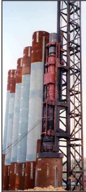
D46-42 in a stand-off.